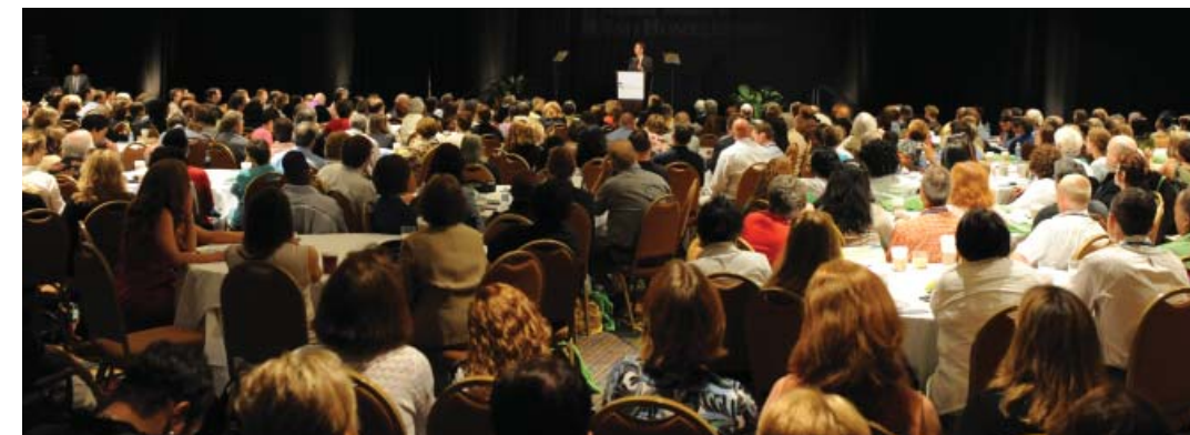
HUD Secretary, Shaun Donovan, speaking at the Alliance's National Conference on Ending Homelessness